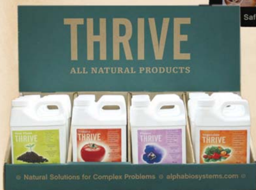
Merchandising options for our Dealers